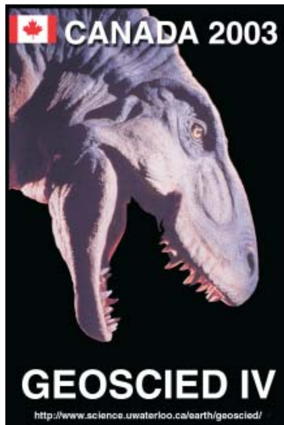
Figure 6 GeoSciEd IV, the Fourth International IGEO Conference, to be held in Calgary in 2003.

We gratefully acknowledge the organizations that have provided financial support