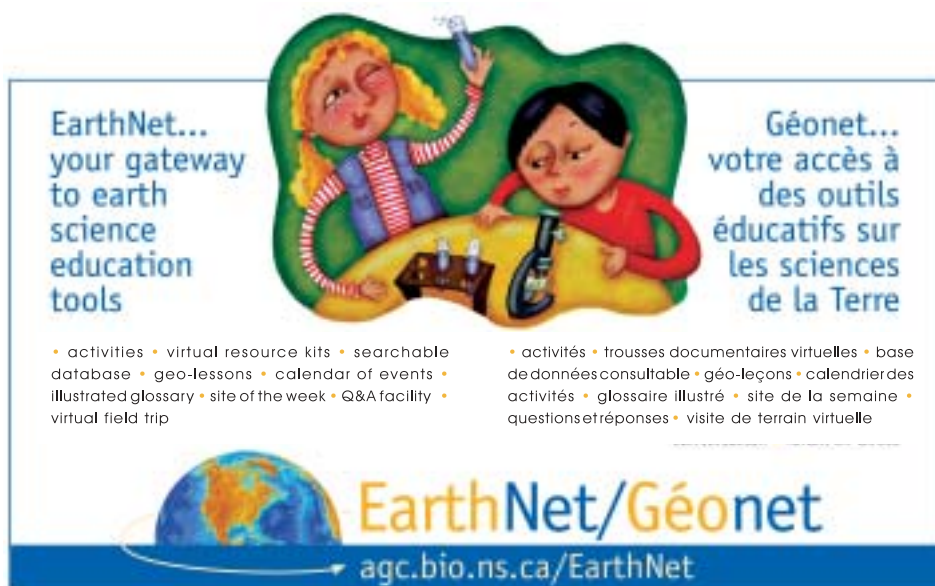
Figure 3 EarthNet, gateway to geoscience education resources.

The Geoscape Canada program, led by the Geological Survey of Canada in partnership with provincial and municipal agencies and educators, communicates practical earth science information to communities across Canada. The program operates on the premise that if we want to