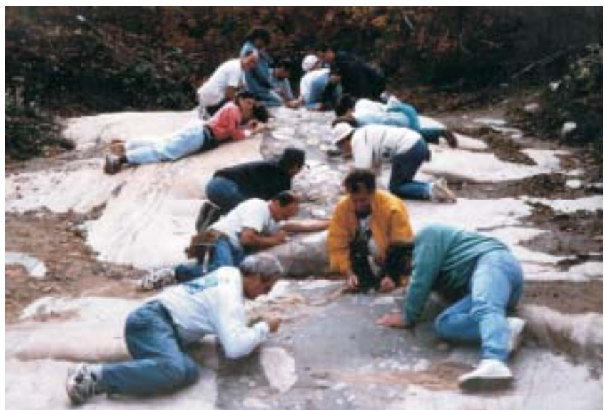
Figure 2 Papineau-Labelle Wildlife Reserve, Quebec: EdGEO fieldtrips provide teachers with a close-up look at local geology and instill in them an excitement and interest to share with their students.