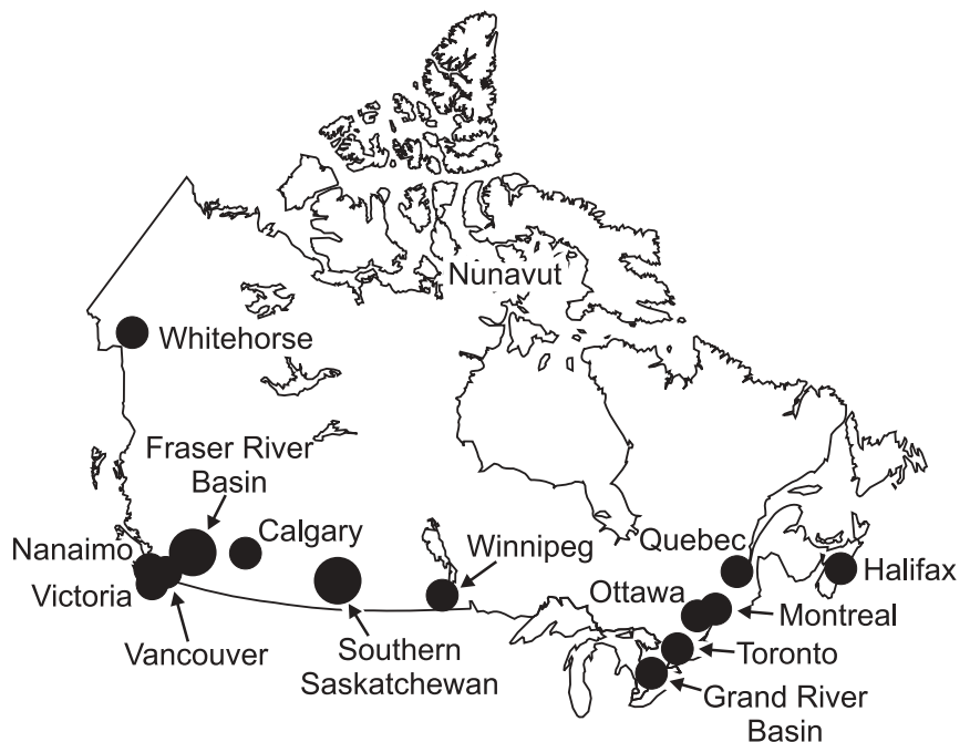
Figure 4 Locations of current Geoscape Canada projects.